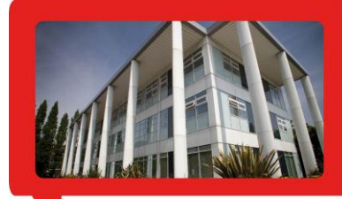
The Nowgen Centre